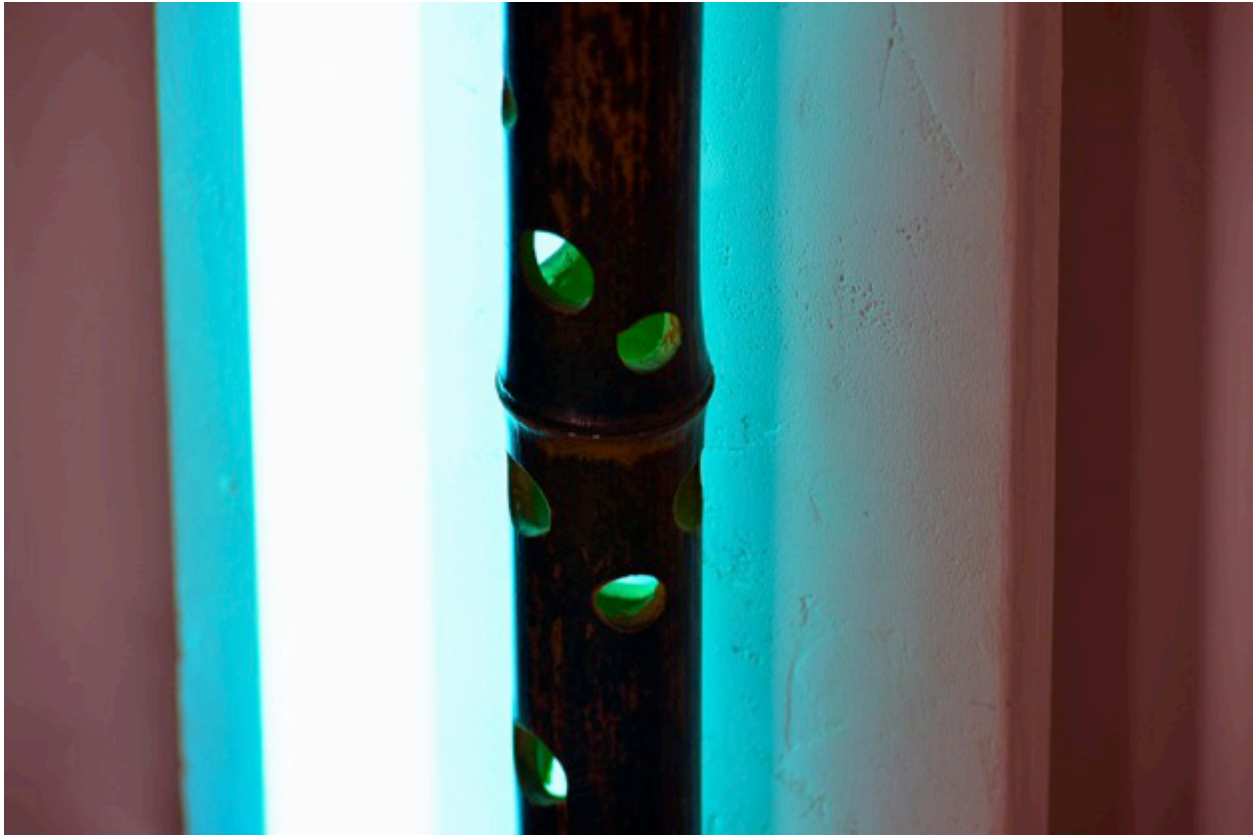
Violet (detail) 2016 UV Lamp, Black Indonesian bamboo, wood, timer.

Brass instruments, the rattle of drums, whistles, a stampede of cheerleaders. The main event is a large vertical object. Not dissimilar to the monolith from 2001. On closer inspection, you see that it's the lid of a disemboweled tanning bed, removed from its original context, and standing in the throw of a projected image. The projection shows a revolving basketball, endlessly morphing out of shape on the contours of the sunbed's surface. On the other side of the lid, a group of plaster-clad hula-hoops are strapped to the structure like necessary appendages. These hula-hoops, great hulking circles of rough hewn white plaster, are the dummy lungs of this Frankenstein. Behind them, the redundant strip-lights flicker and dance. And towards the floor, eggs. Delicate and pink, they balance and roll out across the floorboards, precarious.