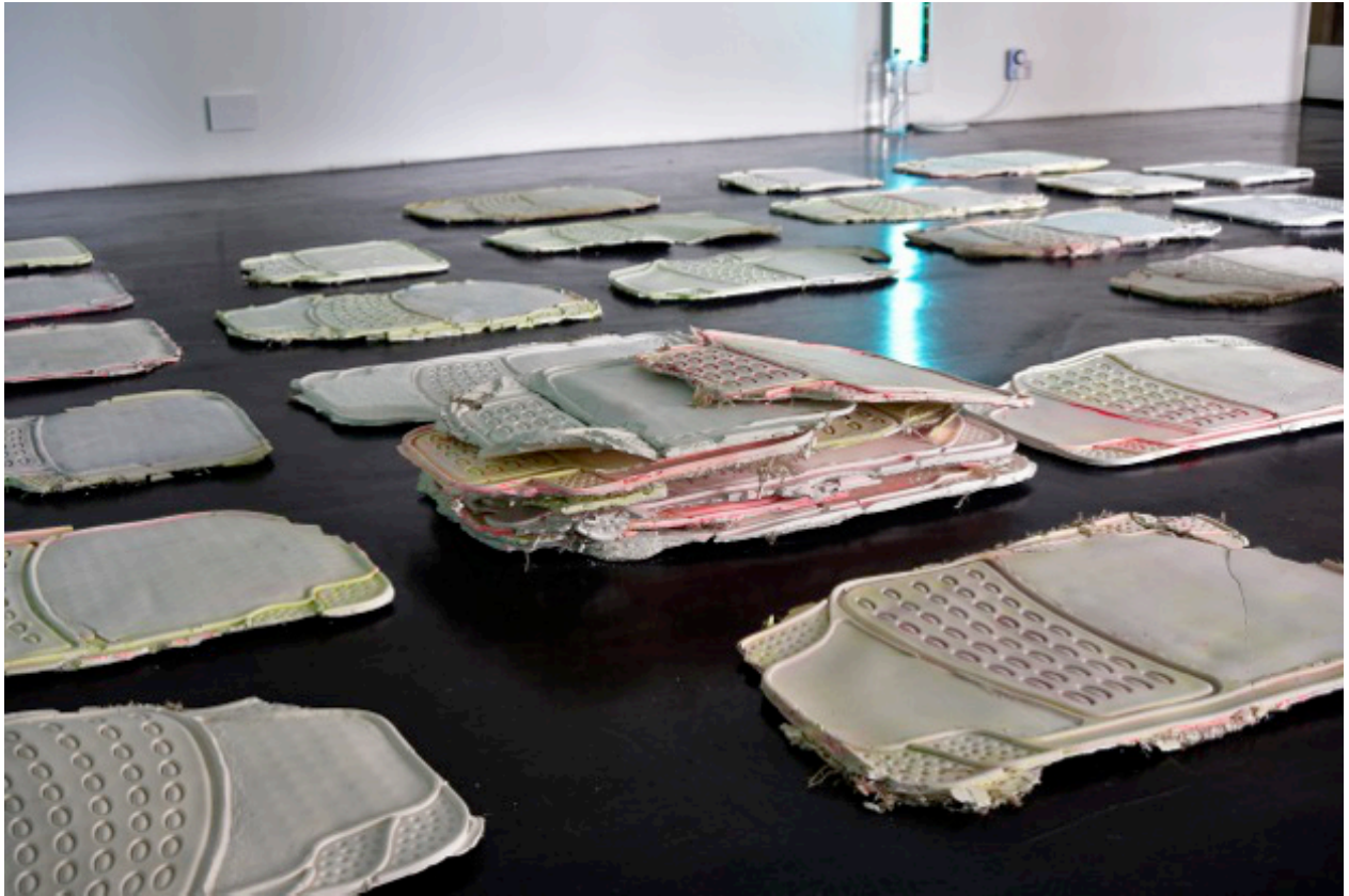
Direction (2016) Installation view, Wexford Arts Centre.

The floor is where everything begins. From there, from around this mass of misplaced onlookers, you follow the hum of the room to the walls. In the corner, a snow screen in negative, with black flakes fluttering on uncertain shadows, seems to flow listlessly like a view from a falling car. On the floor – bottled water, water in bottles, and bottles of water. All around they pepper the room. The two-litre kind, mass-produced in clear toxic plastic. Quite beautiful in form, when stripped of their branded packaging. These are the kind of water bottles you take with you on a long car journey. The kind that, a while back, were reported to carry increased risks of cancer (due to chemical contamination from the plastic) should they be left sweltering for too long in a hot backseat. Something about one of these vessels on the loose, rolling about the floor of the car until it sneaks up under the brake pedal jamming your chances of stopping and impeding your ability to drive, scares me.