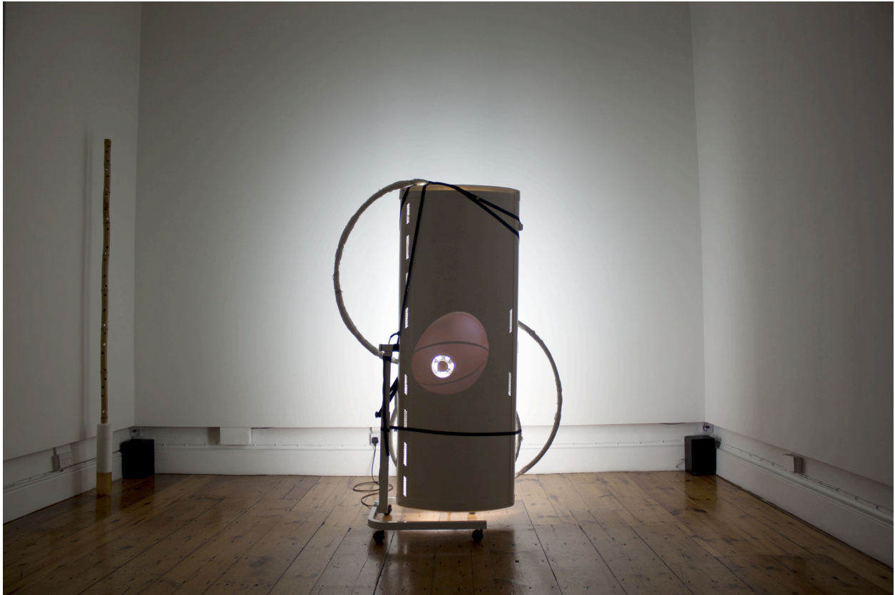
Beyond Violet (2016) Installation view, Wexford Arts Centre.