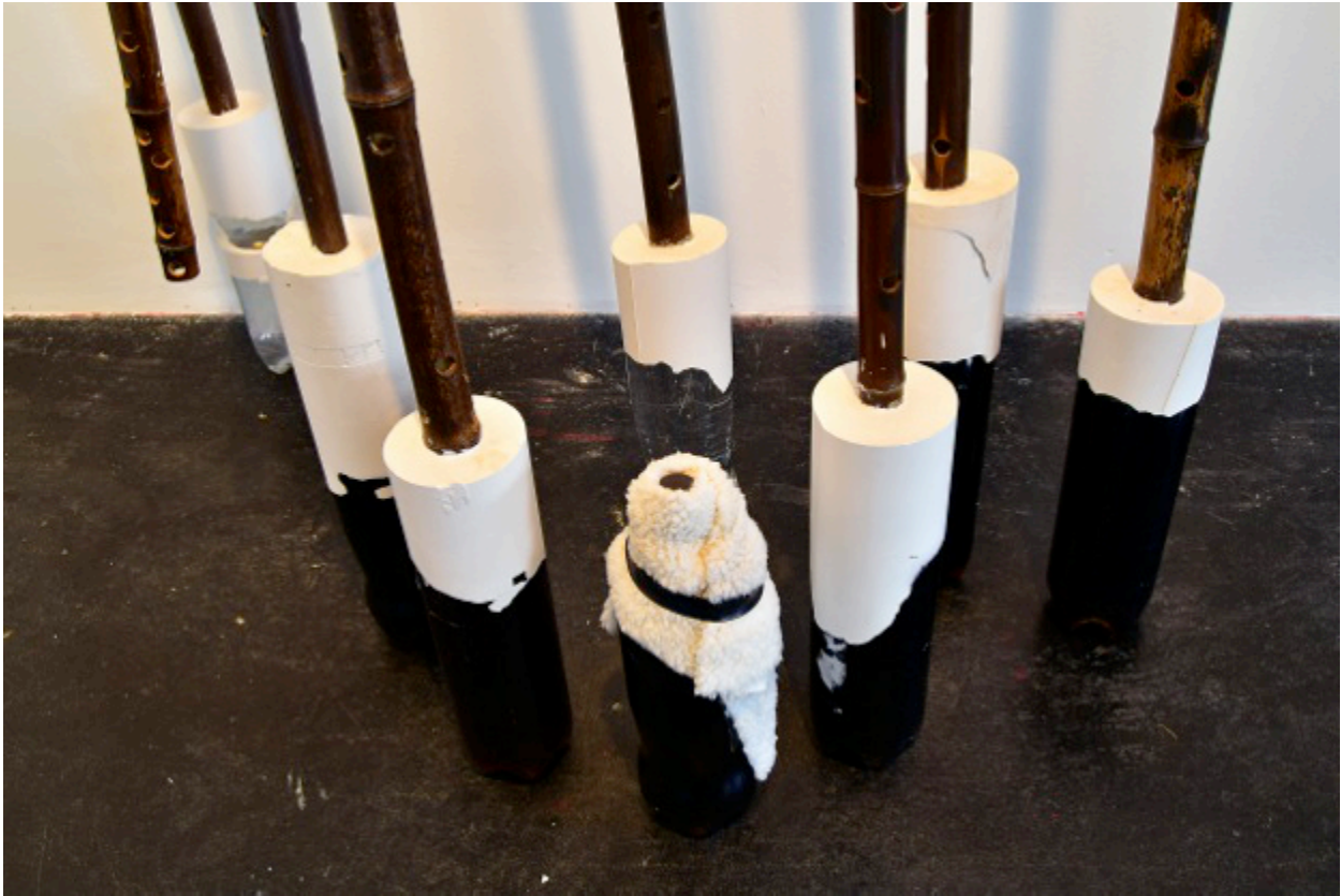
Legendary Mimikry (2016) Coca cola, Sparkling water, Black Indonesian Bamboo, Plaster, Fleece.

diesel siphoned or a petrol bomb waiting to be thrown. Their darkness let's them disappear into the floor, leaving their stalk tops hover like a forest of newly scorched trees. Nearby, three isolated lens discs, removed from sunglasses, dangle as pendants on a coarse string.