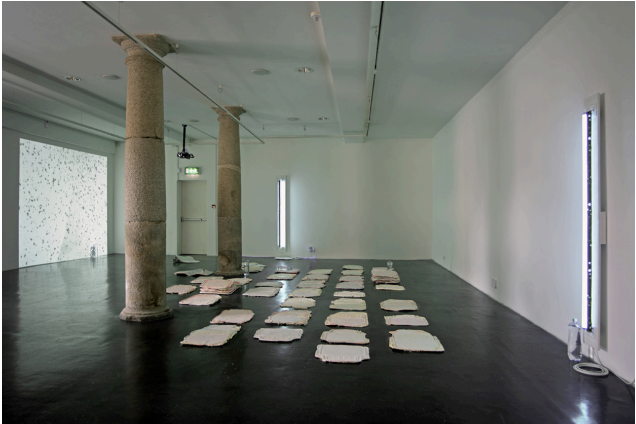
Beyond Violet (2016) Installation view, Wexford Arts Centre.