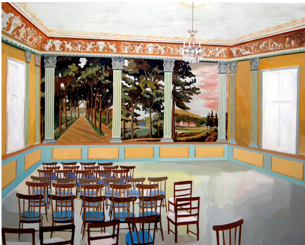
Solitude made Easy , oil and acrylic on canvas, 121 x 152cms, 2012