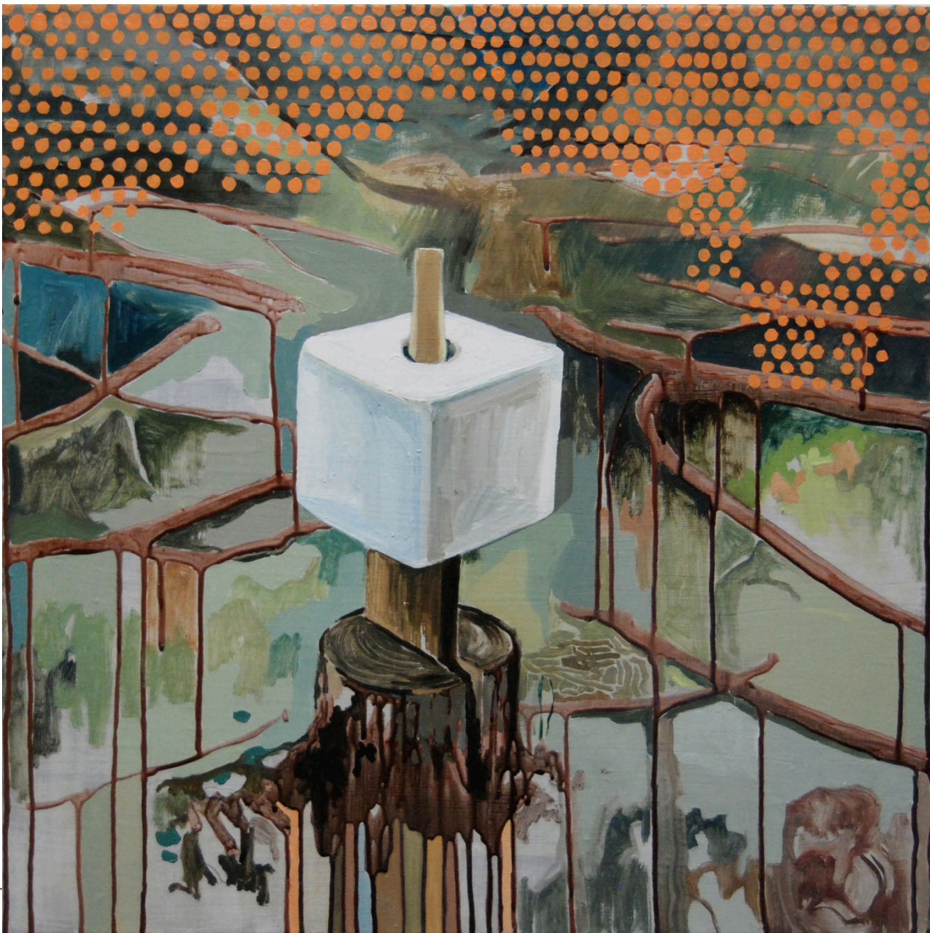
Salt Lick , oil and acrylic on canvas, 55 x 55cms, 2012