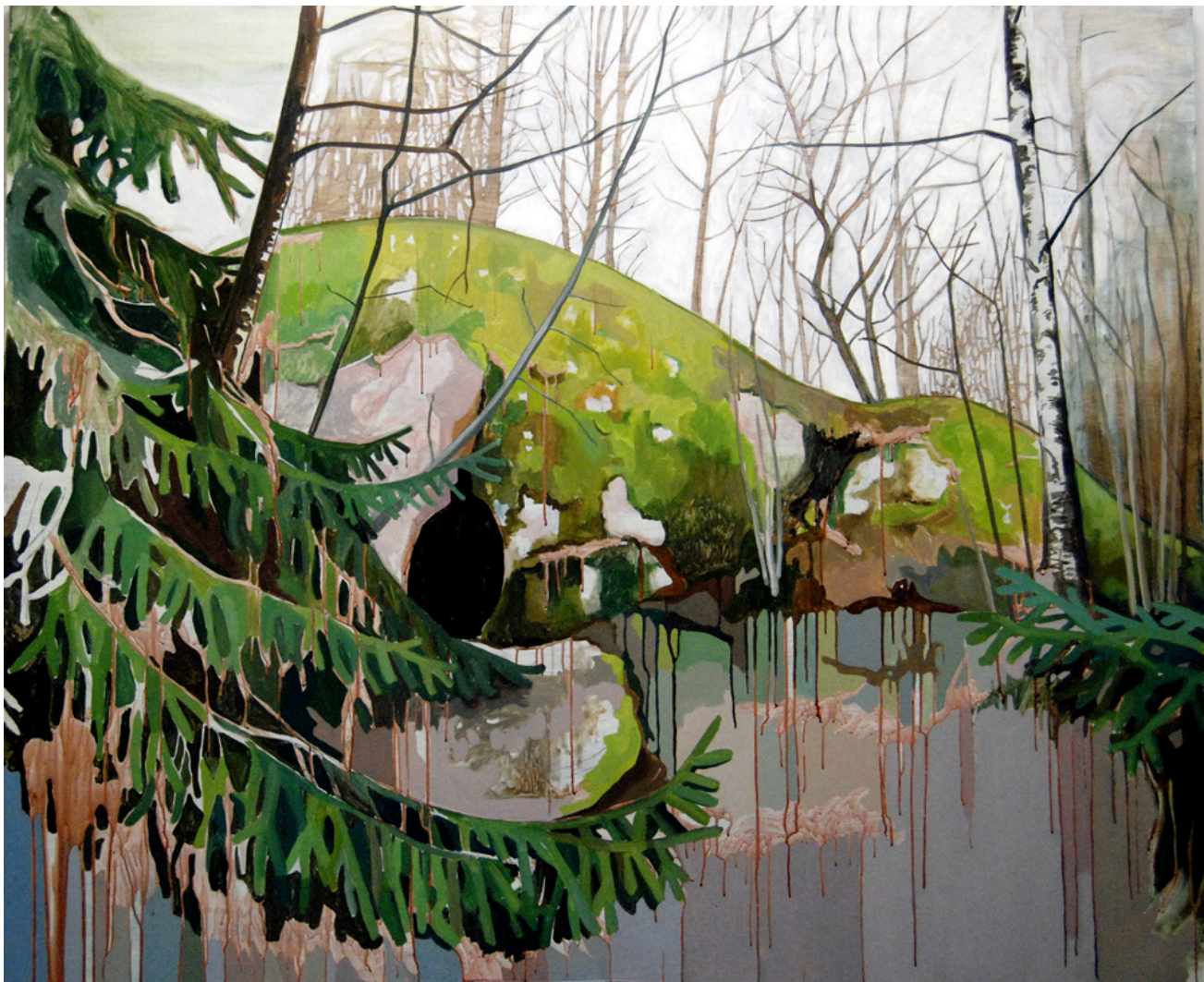
In the Forest of the Secret Depths , oil and acrylic on canvas, 152 x 182cms, 2012