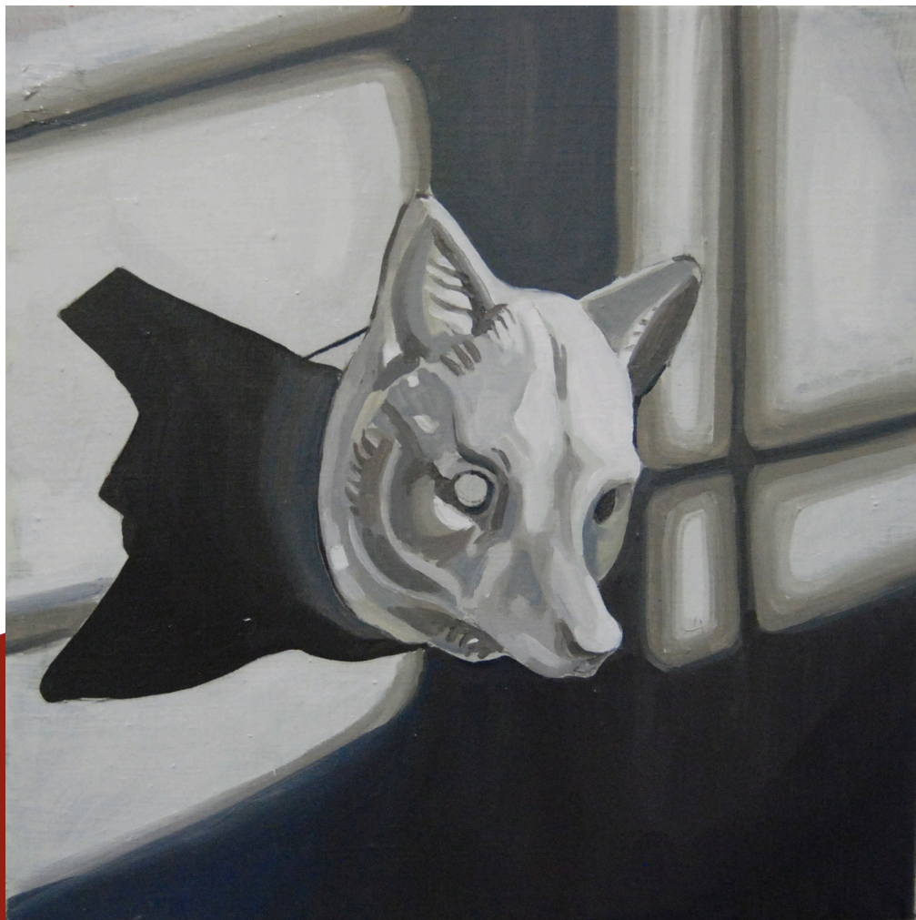
Wolf in the Breast, oil on linen, 30 x 30cms, 2012