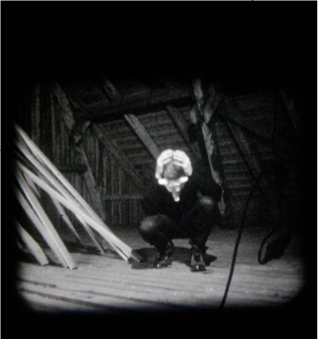
Mutare Animam , super 8 film transferred to DVD, 15 minutes, 2012