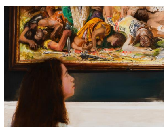
A Further Enquiry - The Taking, 2020, oil on linen, 60 x 40cm