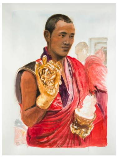
Golden Hand - Bhutan 1974, May 2020, watercolour on paper, 63 x 49cm