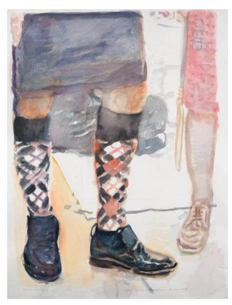
Argyle Socks - Traditions -Bhutan 1974, May 2020, watercolour on paper, 63 x 49cm