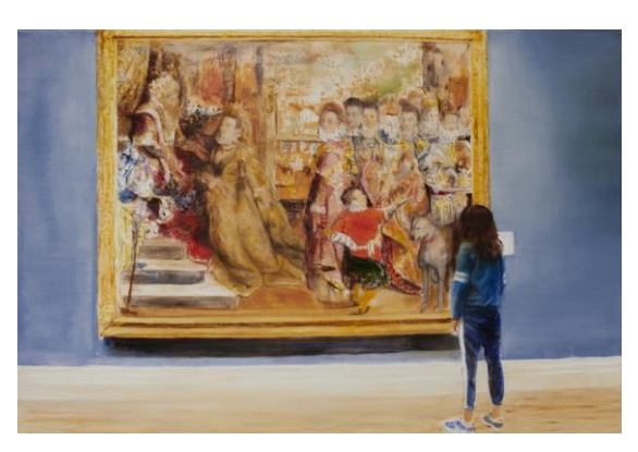
Viewing Lavinia Fontana, 2019, oil on linen, 62 x 92cm