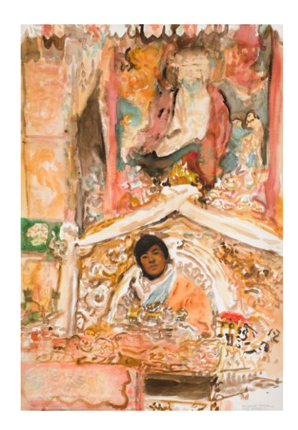
The Coronation - Bhutan 1974, May 2020, watercolour on paper, 56 x 38 cm