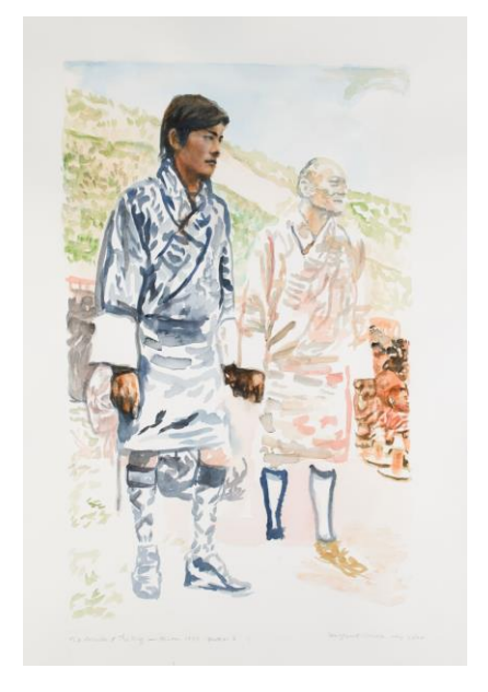
The Prince and The King -Bhutan 1974 - Version II, May 2020, watercolour on paper, 63 x 49cm