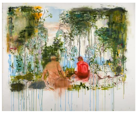
Rwandan Friends, 2016, oil on canvas, 130 x 150cm,