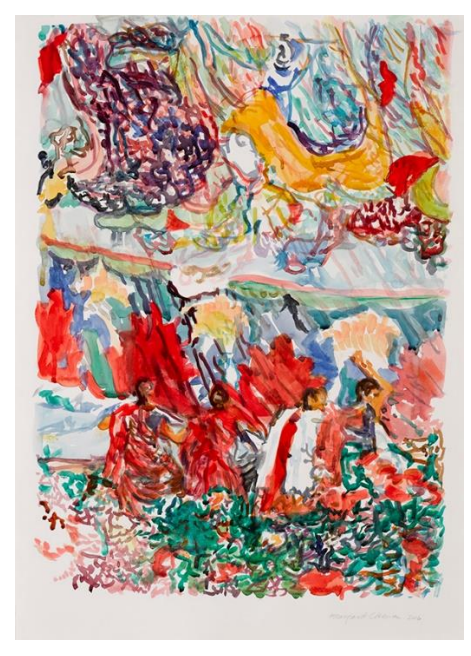
The Kingdom of Happiness, 2016, watercolour on paper, 64.5 x 48cm