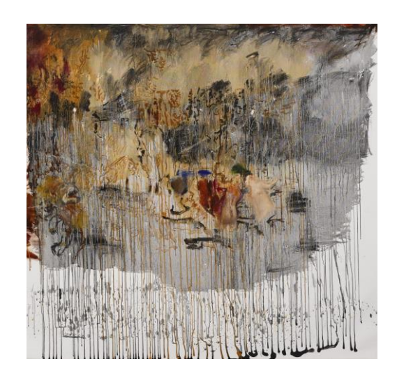
The Disruption, 2017, oil on canvas, 184 x 200cm