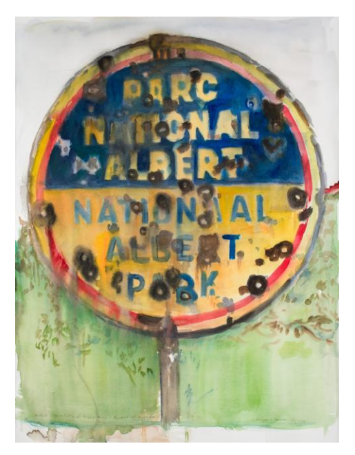
Bullet Sign at Royal Albert Park, May 2020, watercolour on paper, 63 x 49cm, €2200 African Sublime, 2015, oil on linen, 106 x 145cm