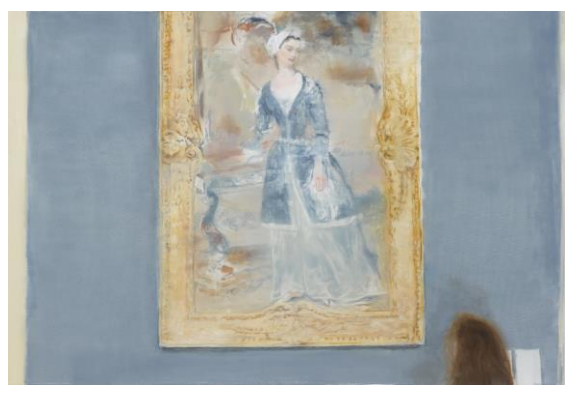
Viewing Lady Bridgewater, 2019, oil on linen, 50 x 60cm