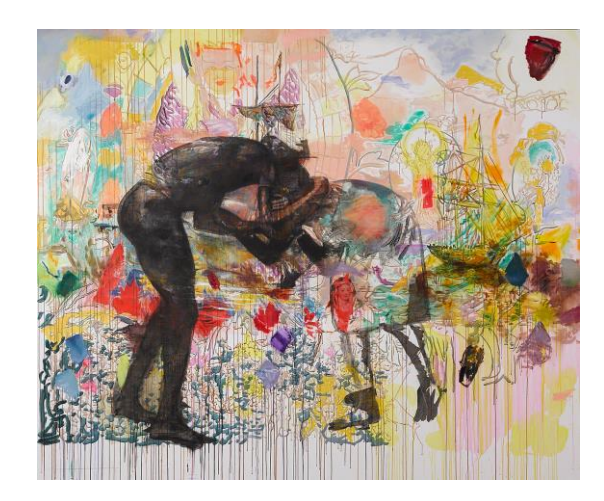
The Courtship , 2017, oil on acrylic on canvas, 190 x 240cm