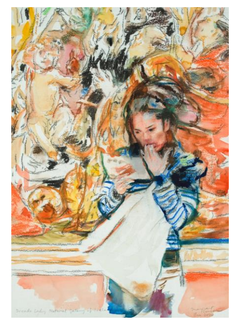
Dreads Lady at The National Gallery of Ireland, January 2020, watercolour on paper, 43 x 30cm